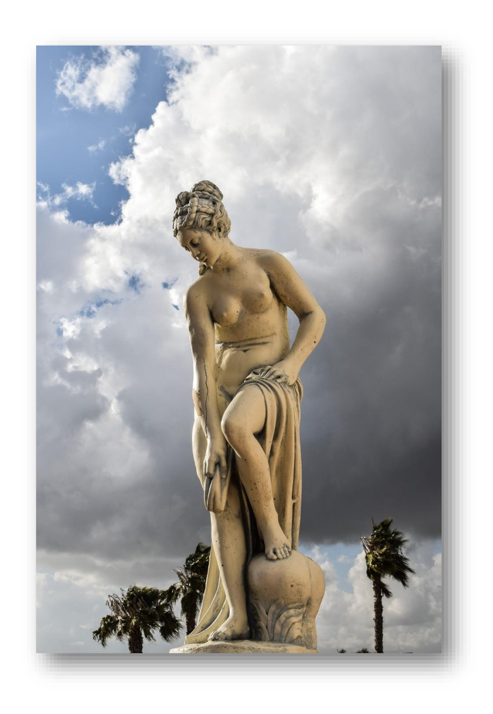
THE 7th GATE, Copyright © ad continuum Starlogic Astrodynamics