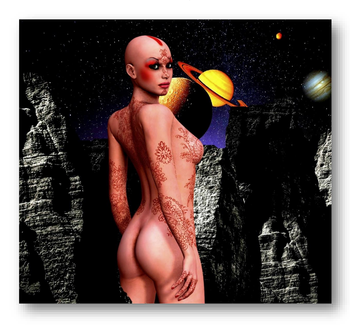
VENUS She's Not Always That Nice

Venus. The goddess of love, passion, beauty, harmony and satisfaction. The great goddess has sides to her however that are less than pleasant. She has very high expectations of perfection and harmony and those who don't meet those expectations will suffer disillusion and disappointment. After all it's all about ideals, although an individual can always turn such situations around if the harshness impels you to do something better.